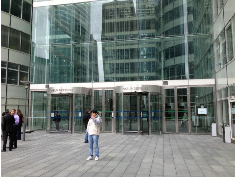
Cœur Défense Main Entrance (Outside)

Your ID is needed to access the entrance of Tower B Please register at the reception desk to get a temporary “Visitor” badge.