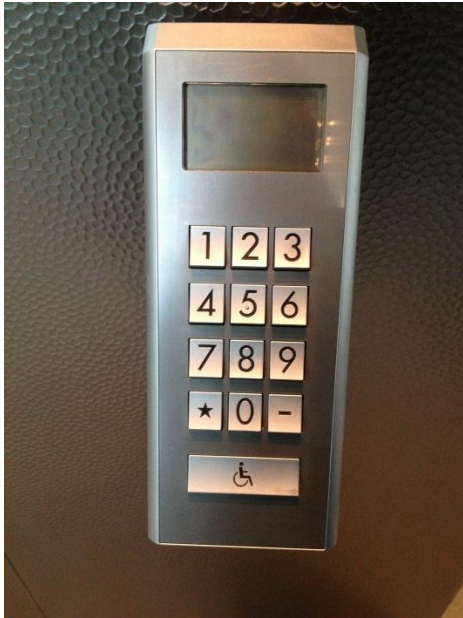
Elevator Numeric Keypad (1)

To access the Citrix office on level 31 st , enter “31” in the elevators numeric keypads (1) and go to the elevator which is indicated on the screen (2):