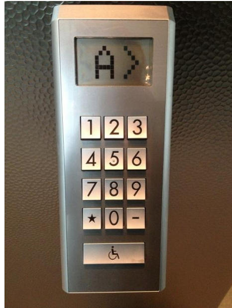
Elevator Numeric Keypad (2)