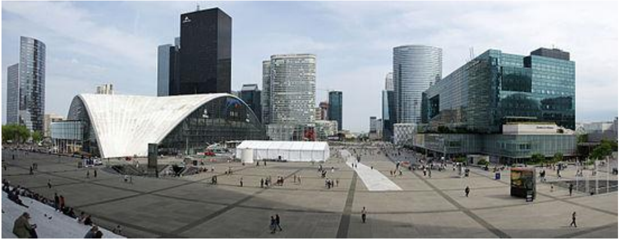
Parvis de la Défense